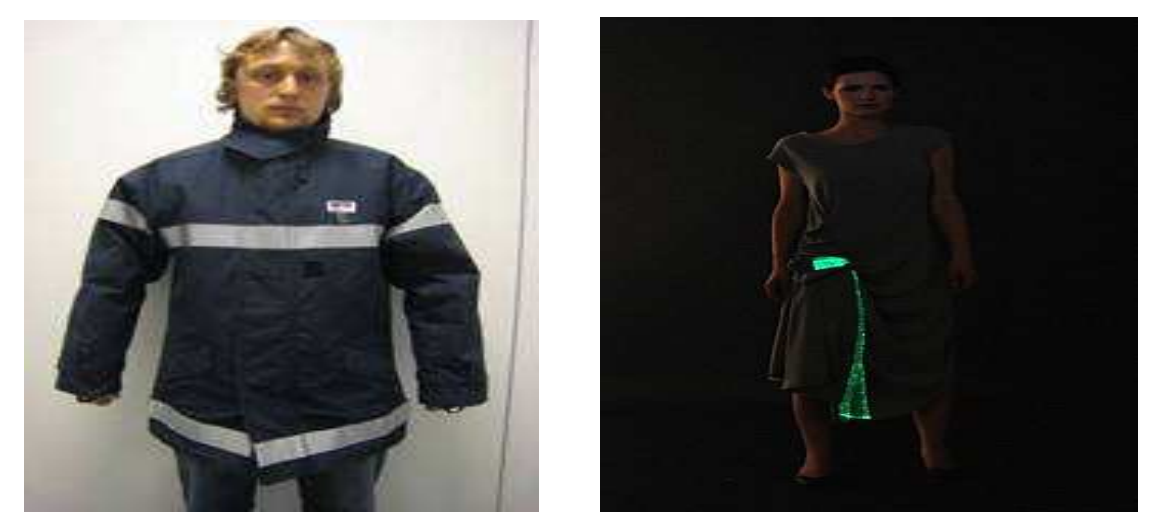
Figure 1 & Figure 2: LED As A Part of Fabric Fashion.

Conductive textile is a new field in Technical Textiles. Textile is not only use as a simple garment or cover purpose but also it can be used to any trouble shooting purpose. In this article only the use of common conductive textiles is discussed. But there is a lot of scope to cater textile not as an integrated part of a metallic composites only, we can make fabric itself with an inherent conductive properly.