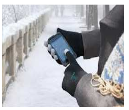
Figure 7 & Figure 8