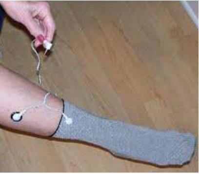
Figure 5 & Figure 6