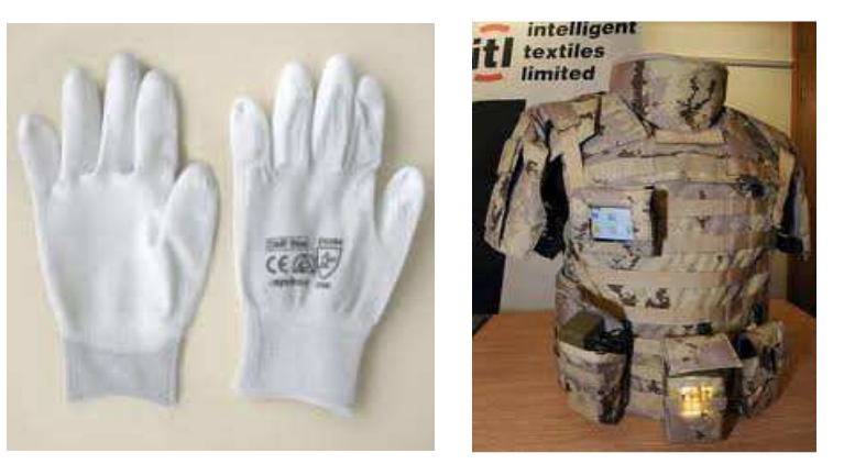
Figure 3 & Figure 4